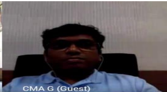
CMA G (Guest)