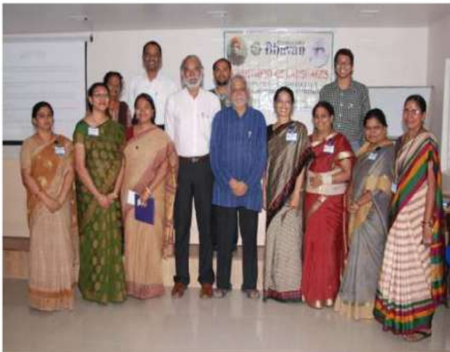
Guest Speakers with Faculty members