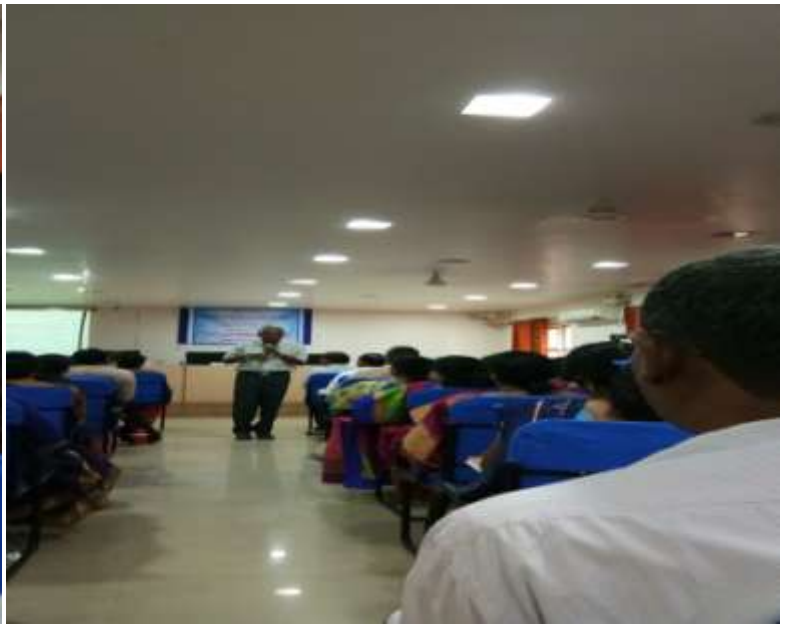
Faculty Development Program at R K Math