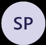
S. S. CHIRIYANNA MAUDY