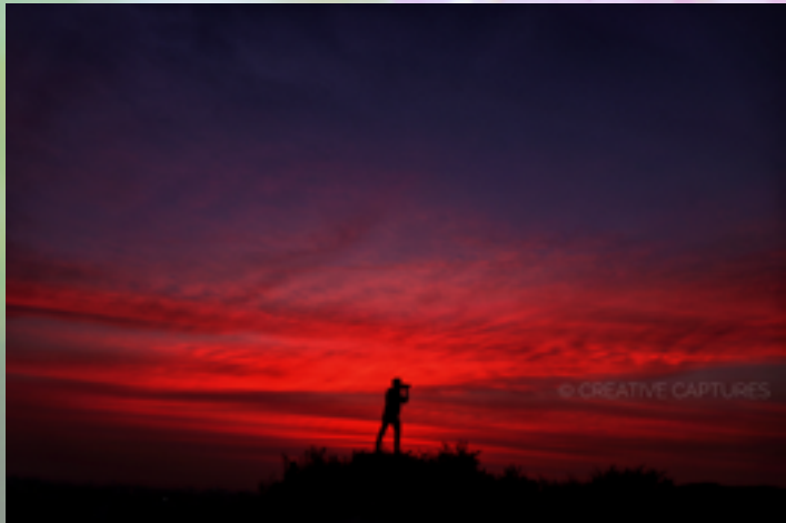
Vivek BBA 3yr