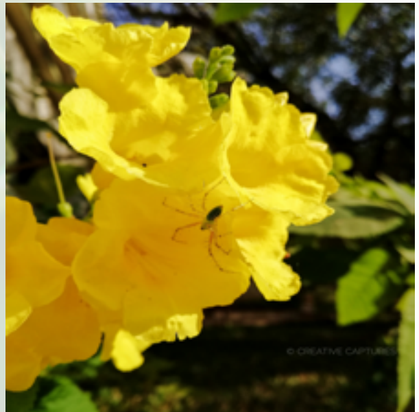
Vivek BBA 3yr