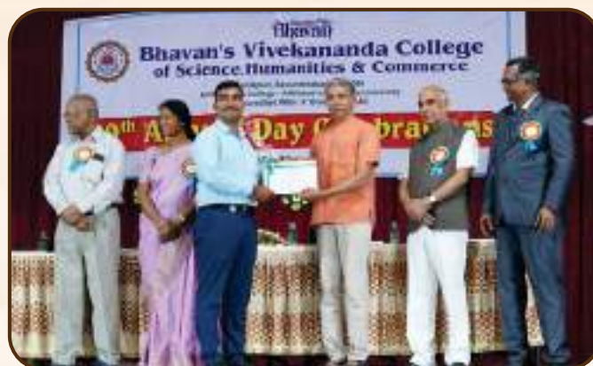
Felicitation of Toppers