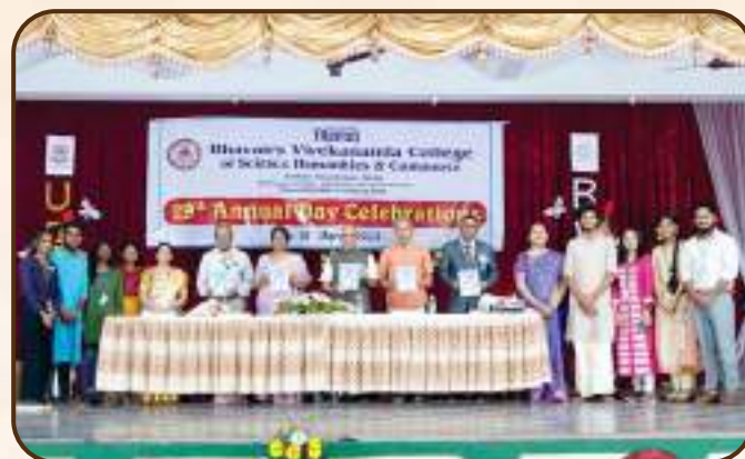
Release of College Magazine Vibha