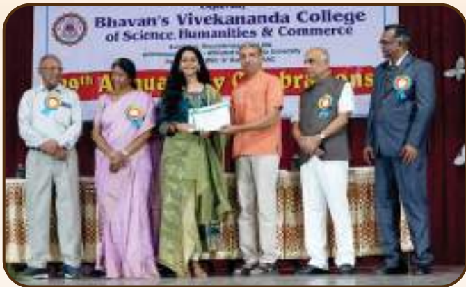
Felicitations of Toppers