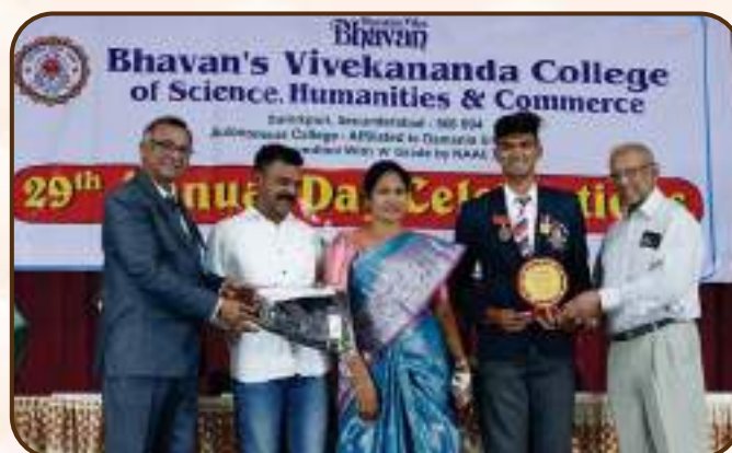
Felicitation of NCC Cadets