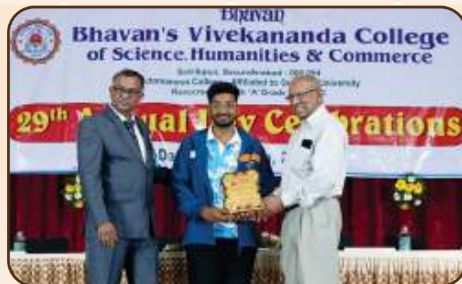
Felicitation of BVC Sportspersons