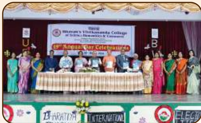
Book Release - A Journey through 30 years of Academic Excellence