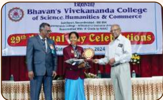
Felicitations of NCC Cadets