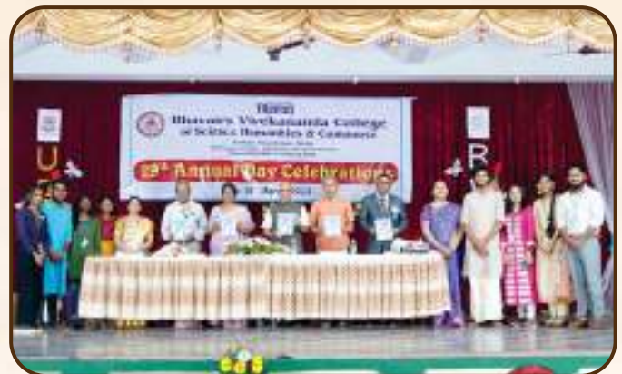
Release of College Magazine Vibha