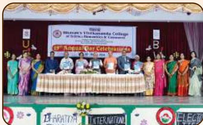
Book Release - A Journey through 30 years of Academic Excellence