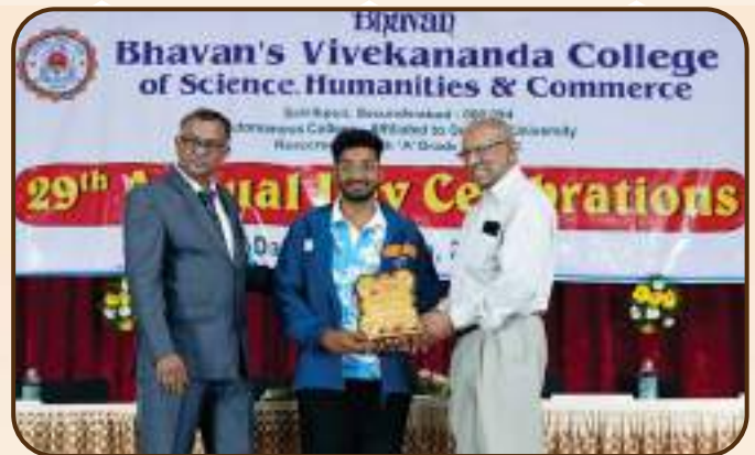
Felicitation of BVC Sportspersons