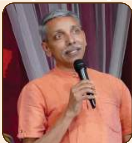
Prof. M. Jagadesh Kumar

The college celebrated its 29 th Annual Day on 09 March 2024.